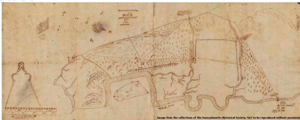
A Winthrop family member drew this map in 1637.

In 1631, Winthrop selected for his personal estate a 600-acre tract of land along the western bank of the Mystic River, about six miles north of Boston. The records of the colony's Court of Assistants describe this land grant as being "near his house at Mistick to enjoy it, to him and his heirs forever." Winthrop called his estate "Ten Hills Farm," either because of ten small knolls on the property or to describe the ten hills around it.