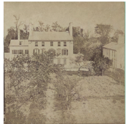
This 19 th century photograph illustrates the openness of the former Royall estate before it was developed as an urban neighborhood.

The Royalls, like other eighteenth-century landowners, used their personal landscape to illustrate their taste, power, and wealth. Most specifics about the Royalls’ gardens are lost, but the surviving evidence begins to develop our understanding.